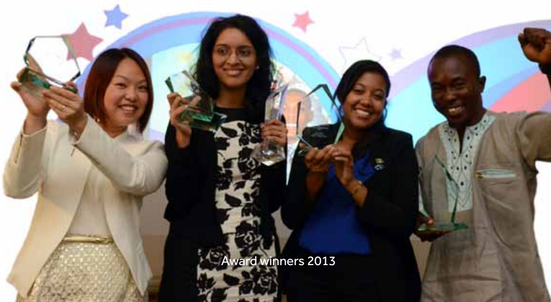
Award winners 2013